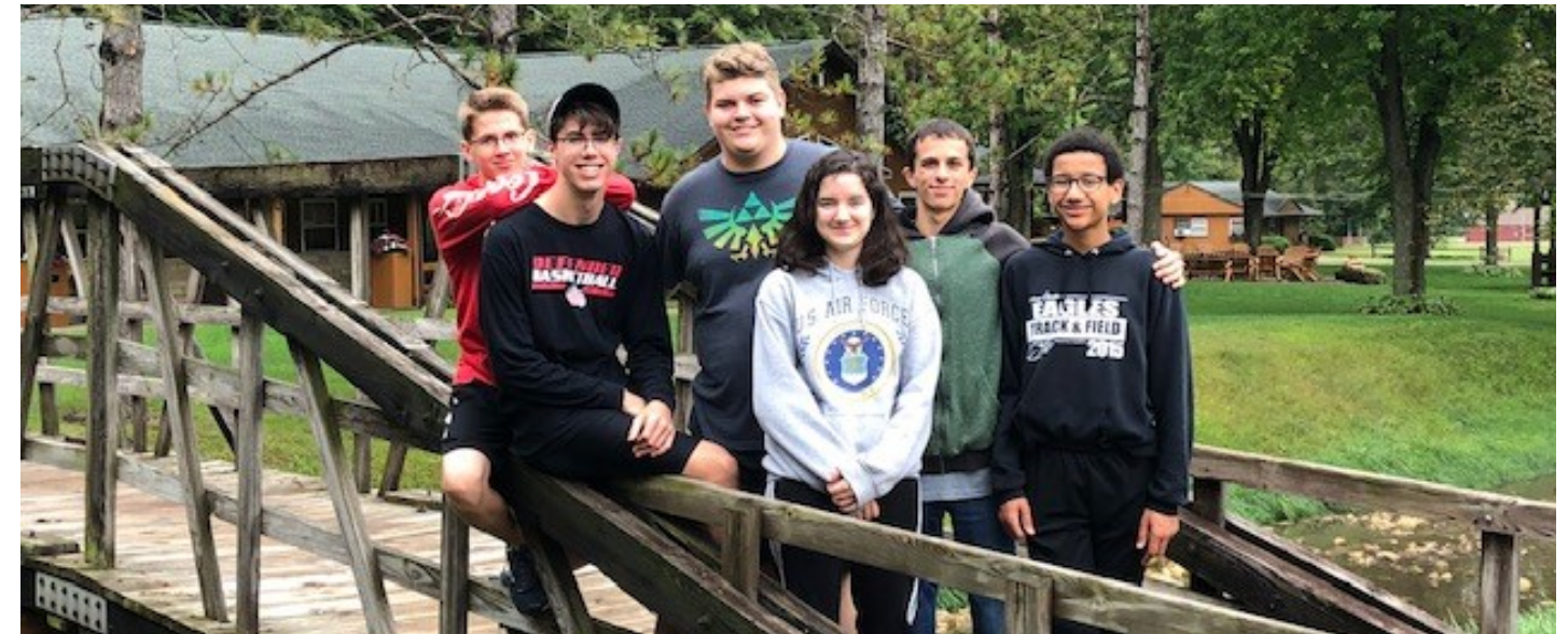
Our first graduating class of 2020 at "Trailblazer Camp" this fall.